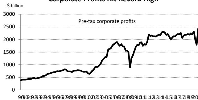
Corporate Profits Hit Record High

The faster growth in output relative to worker hours translates into stronger productivity, which is also a common feature early in the recovery process. What’s more, worker bargaining power is restrained until the labor market tightens later in an expansion. That means more of the increase in productivity goes into profits than labor compensation. Given the massive destruction in jobs during the pandemic – 22 million in March and April of last year – of which 9.4 million remain on the sidelines, it will be a while before workers regain the bargaining power they had prior to the pandemic, when the unemployment rate fell to 3.5 percent and the labor force was drum tight.