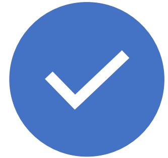
ANY JOB SPECIFIC SOFTWARE